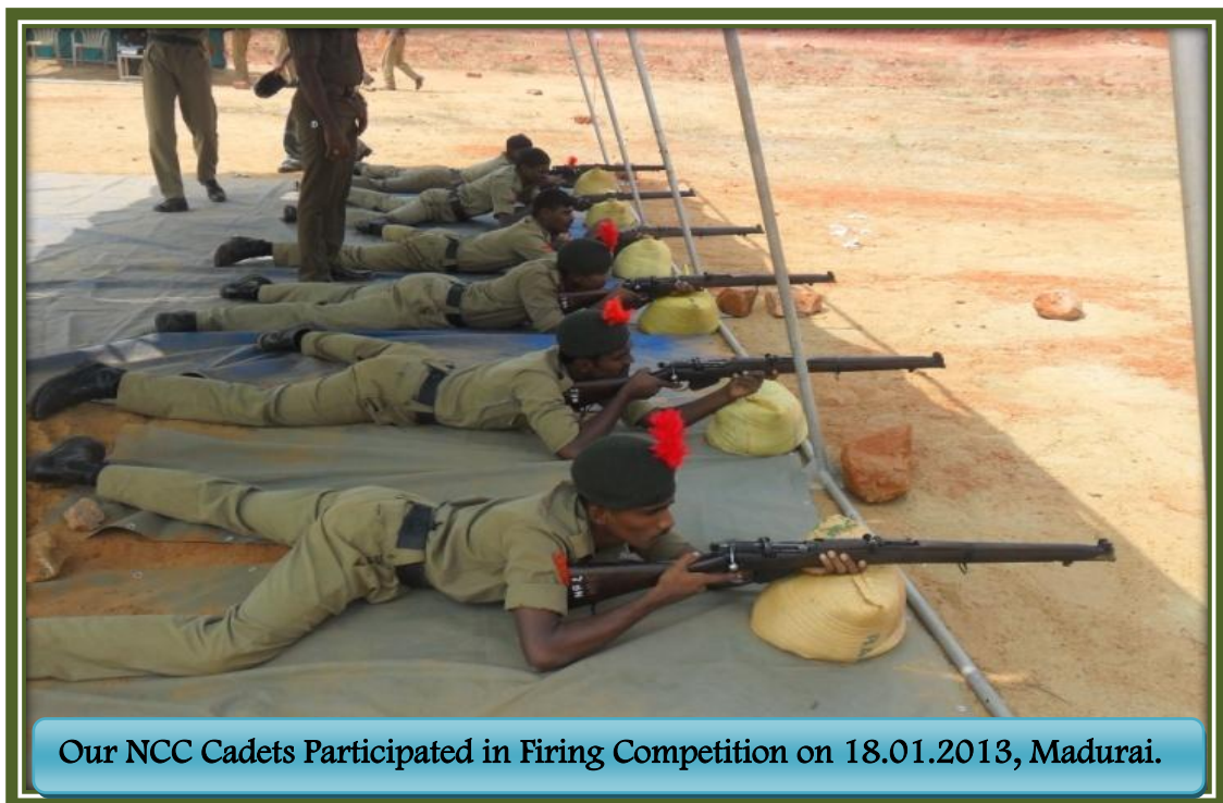
Our NCC Cadets Participated in Firing Competition on 18.01.2013, Madurai.