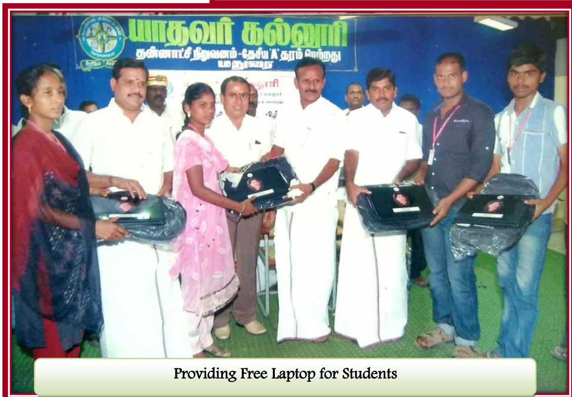
Providing Free Laptop for Students